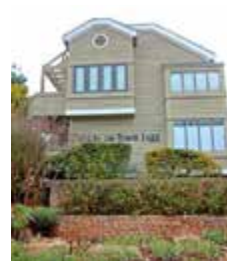
Villas on Town Lake